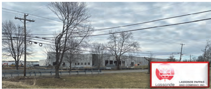
Lassonde's investment in warehousing, distribution and a new-state-of-the-art production plant in Upper Deerfield.

Cumberland County Improvement Authority (The Authority) was featured in a recent article in Invest South Jersey publication that took note