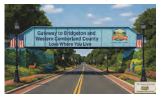
AI rendering of what train bridge gateway project could look like.

Grants were approved for three additional beautification projects. Broad Street Cemetery was approved for $3,400 for its peace and reflection