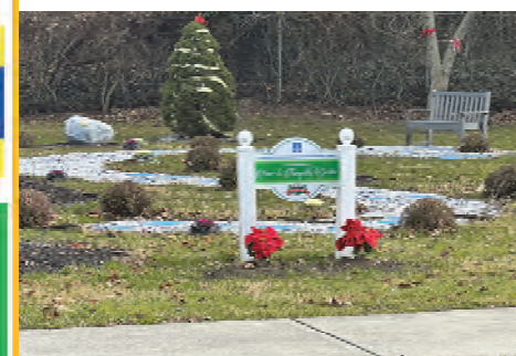
Cumberland County Soroptimist Club received Love Where You Live funds to improve is Peace & Tranquility Park in Bridgeton City Park.

In 2025 and the first month of 2026, the Love Where You Live project, administered by the Bridgeton Area Chamber of Commerce Foundation and its Love Where You Live Committee funded four beautification projects, publicized two done by others, and approved three others. The program has received $35,000