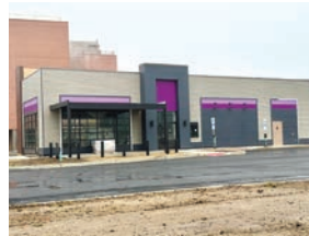
Taco Bell construction in downtown Bridgeton at Rt. 49 and S. Laurel St. is nearly complete.