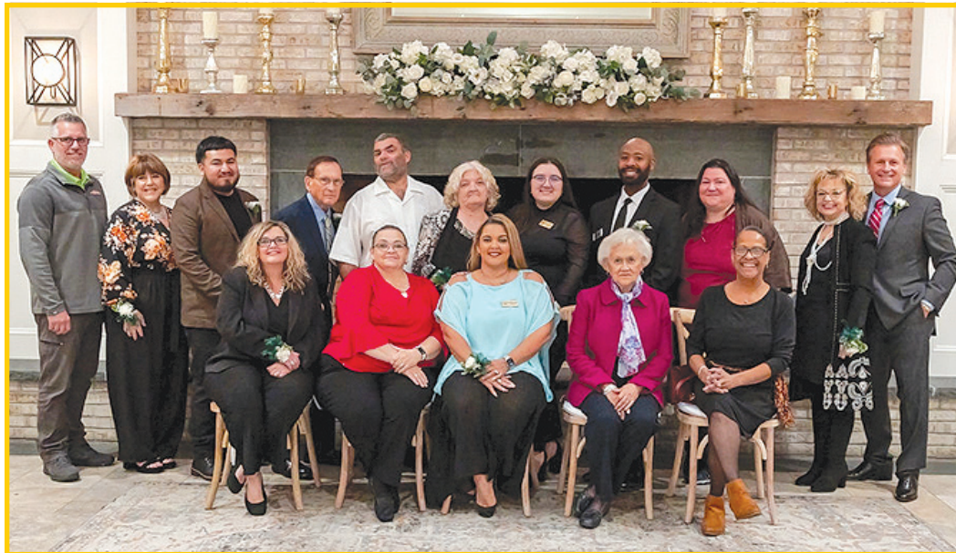
Congratulations to The Chamber's 2023 Business and Community Hero Award Recipients