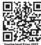
Cumberland Expo 2022