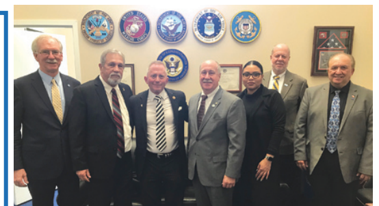
Cumberland County delegation visits with Congressman Jeff Van Drew (3rd from left)